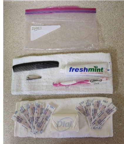
The pictures of Cleaning Bucket and the Hygiene Kit are taken from the UMCOR web site.

This information is to keep you informed of how CUMC is supporting the Bluegrass District and Conference as the we respond to this Disaster.