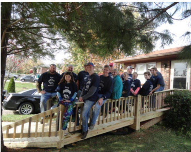
November 2015—Oldest Picture Available