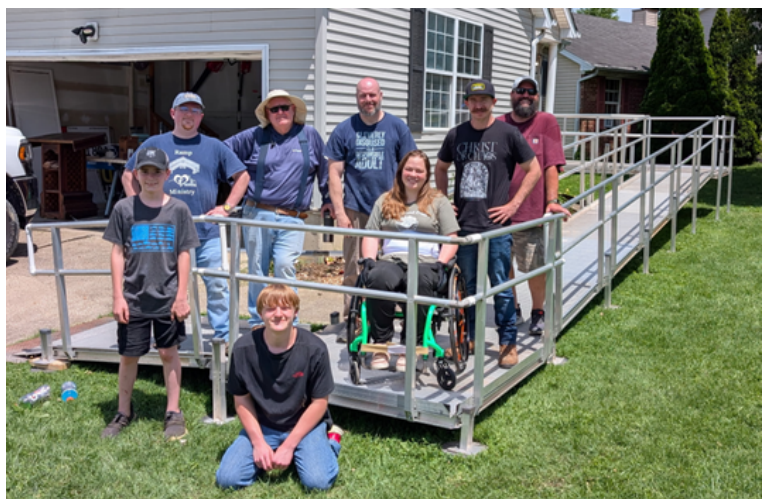
Ramp Build- June 2026